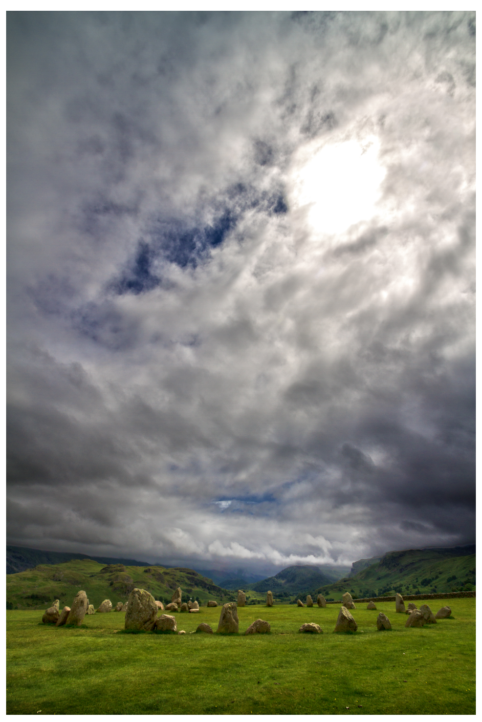
Castlerigg Stone Circle in Cumbria, England, by Graham Richter