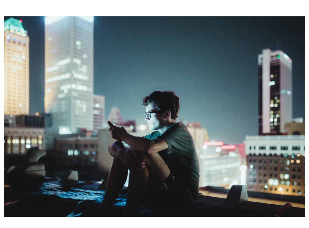
Oklahoma, USA

Some men try to save themselves from that by watching "How to"-tutorials on Youtube; "How to become a better lover", "How to be successful", "How to deal with trauma".